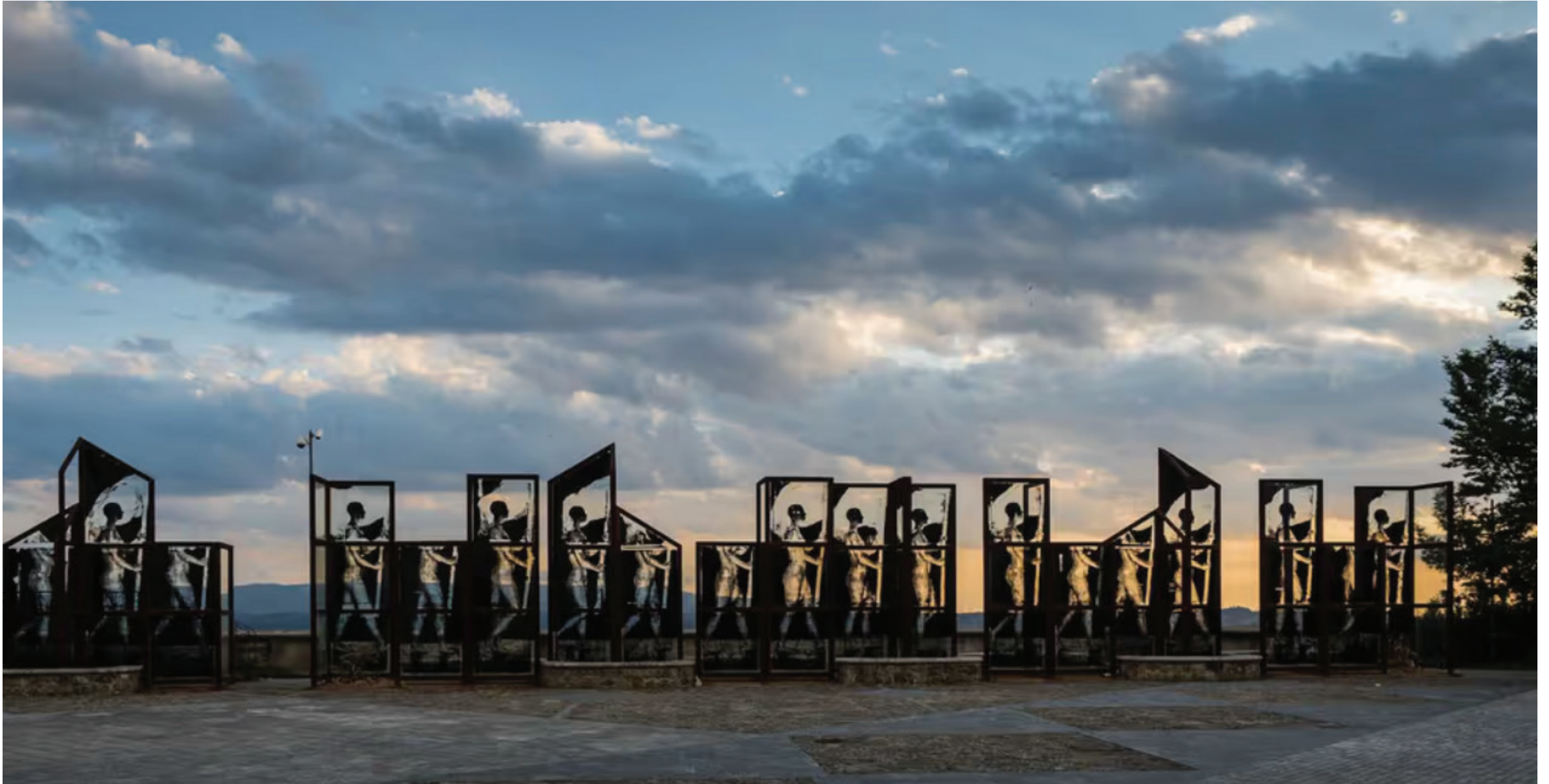
Gonzalo Borondo, ARIA, installation, Catanzaro (IT), 2017