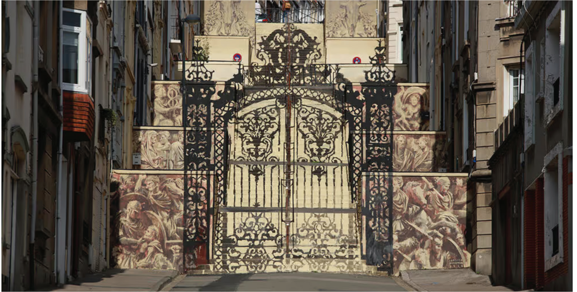
Gonzalo Borondo, PASSAGE, acrylics on wall, Boulogne sur mer (FR), 2020