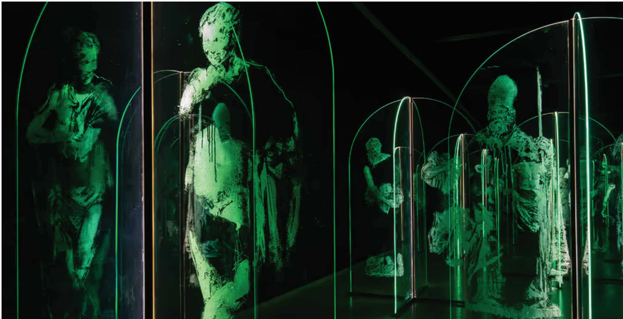
Gonzalo Borondo, éter, installation, 2021